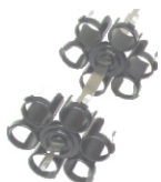
Up to 12x 30mm places Bloating and Hybridization rack.